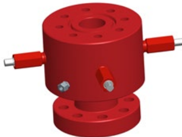
Optional wellhead spool.

The Ren Gate wellhead-penetration conversion kit provides hydraulic communication through the wellhead to the downhole safety valve.