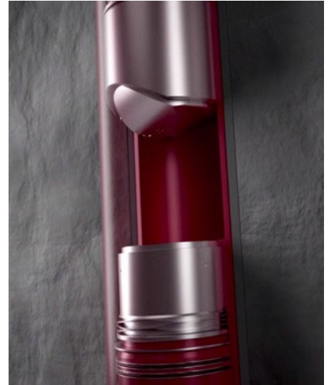
The Weatherford DDV integrates seamlessly into the casing program.

The RIT DDV meets the NACE MRO-175 standard for hydrogen sulfide (H 2 S) applications.