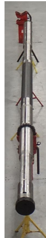
RIT DDV assembly