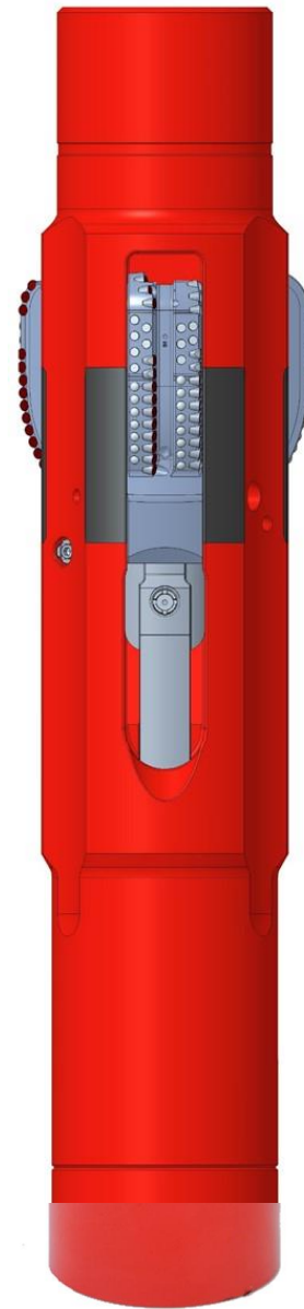
The Weatherford RipTide drilling reamer has retractable and concentric cutter blocks that minimize vibration while drilling and facilitate tool retrieval.

The RipTide Quattro drilling reamer 12000 significantly advances traditional ball-drop designs for cost-effective capabilities. Its field-proven, extrudable ball-drop system enables multiple activations and deactivations of the reamer on a single BHA trip. The number of activation cycles varies depending on the length of the ball catcher chosen for the specific application. The standard design enables four cycles, with one activation and one deactivation per cycle, because it has a retention capacity for eight balls.