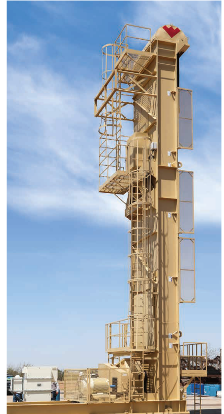
Compared to standard pumping units, the Weatherford Rotaflex long-stroke pumping unit improves productivity with a longer stroke, more complete barrel fillage, and less wear on surface and downhole equipment.

Paired with the optional WellPilot® controller, the Rotaflex unit optimizes each and every stroke for more efficient lifting than a beam-unit, rod-lift system.