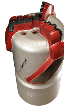
Photo depicts the 13 3/8- x 17-in. Defyer DT306.

Defyer DT bits can be drilled out with any standard oilfield drill bit without compromising the cutting structure. A range of interchangeable, drillable nozzles is available to ensure optimal hydraulic performance.