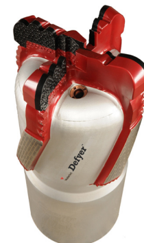
Photo depicts the 9 5/8- x 12 1/4-in. Defyer DT406.