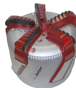
Photo depicts the 24- x 27-in., 5-blade Defyer DT506.